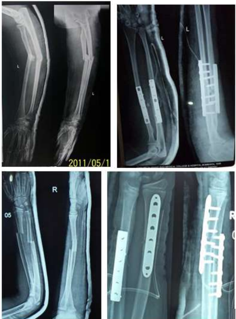
Figure 1: Preoperative and immediate post operative xrays

A Prospective Study of Clinical and Radiological Outcome in Fracture Both Bone Forearm in Adults.